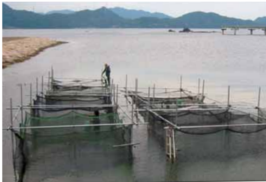
Acclimation cages in Japan “zipper” closed so fish can be stocked and released easily.