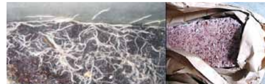
White worms (left) are a promising live feed for conditioning juvenile winter flounder. In Japan, juvenile marbled flounder at Hyogo Prefectural Center for Stock Enhancement are fed frozen shrimplike mysids (right).

When this technology was transferred to the U.S., there were two problems.