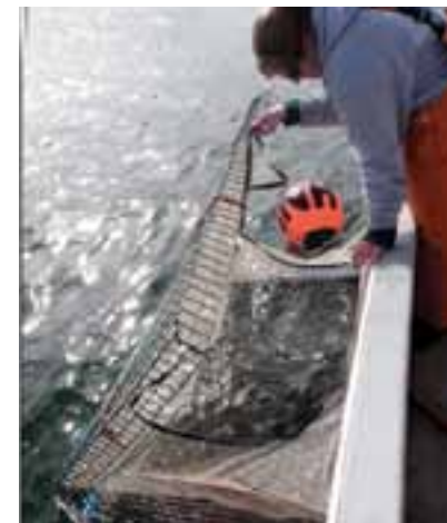
From 2009 to 2011, the University of New Hampshire deployed floating cages of juvenile winter flounder at and just below the surface.

In the field, hatchery-reared winter flounder, Pseudopleuronectes americanus , grown on white worms exhibited survival, diet profiles and RNA/DNA compositions similar to those for wild fish. In Japan, juvenile marbled flounder, Pseudopleuronectes yokohamae , at Hyogo Prefectural Center for Stock Enhancement are fed a mixture of minced frozen mysids with additional formulated feed to boost nutritional content. However, formulated feed is stopped two weeks before release to redirect fish to more natural feed.